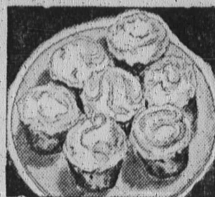
Frosted CUP CAKES Go Fast!