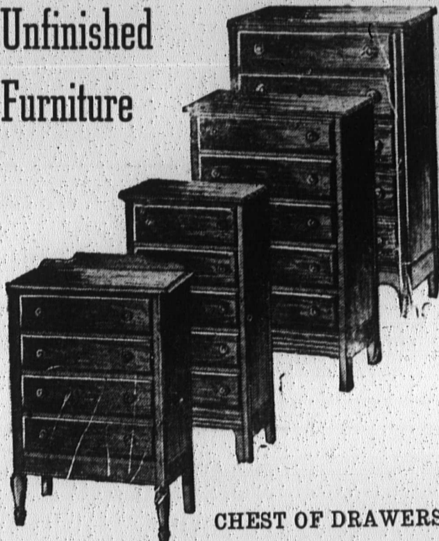
CHEST OF DRAWERS

4 sizes from which to choose $10.95 to $15.95