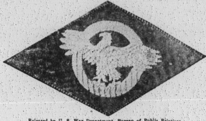
HONORABLE SERVICE PATCH —This design of the Honorable Service Button is worn on service uniforms above the pocket on the right hand side of the blouse. The dexter eagle in the circle is in gold on a diamond of khaki or olive drab cloth. The picture above is slightly larger than the official patch.